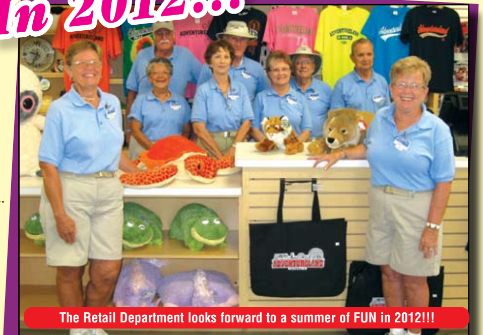
The Retail Department looks forward to a summer of FUN in 2012!!!

Many of our Workampers will be returning for a summer of FUN in 2012! We would like you to consider joining our team. Read on to learn more about us and how you can fit into our operation this coming season.