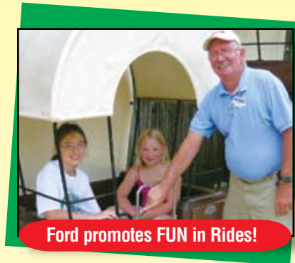
Ford promotes FUN in Rides!