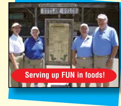
Serving up FUN in foods!