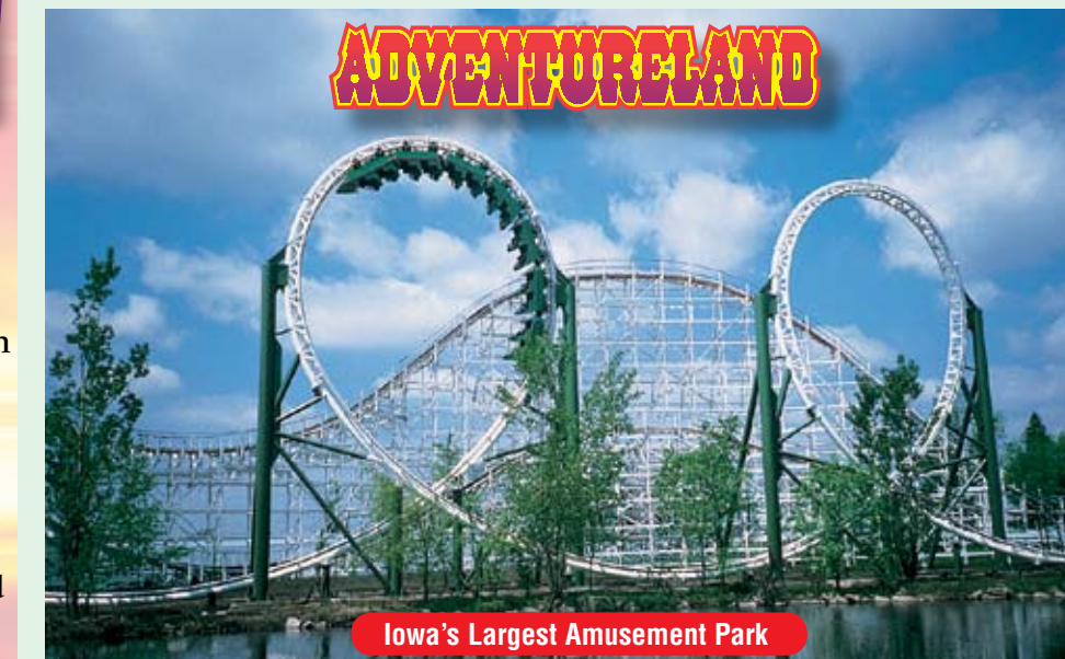
Iowa's Largest Amusement Park

Please note: Our business is providing fun to our guests at an outdoor amusement park.