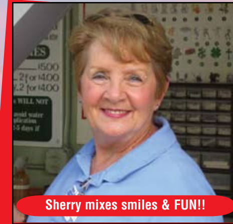
Sherry mixes smiles & FUN!!

We have a dress code that we ask all of our team members to follow. Adventureland works at developing a clean, well kept appearance.