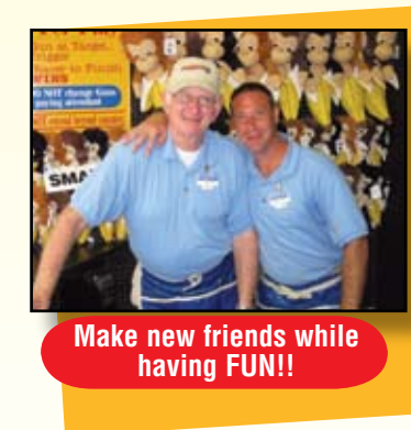
Make new friends while having FUN!!