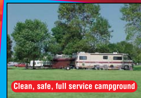
Clean, safe, full service campground

Our campground boasts a Five Star rating. There are paved sites, complete hook-ups, picnic tables, laundry facilities, comfort stations with showers, and recreation hall with outdoor pool. Wireless Internet service is available for a nominal fee.